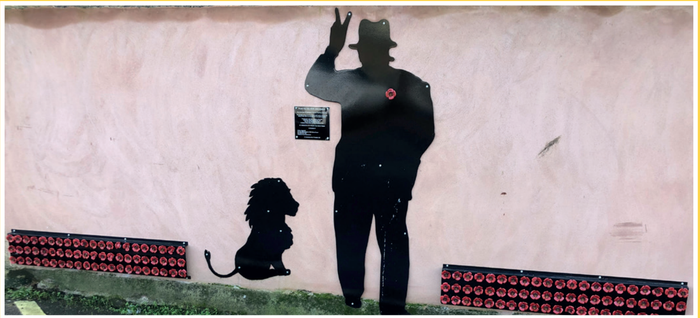
Commemoration artwork of World War 2 (1939-1945) when 125 Brixham people were killed.